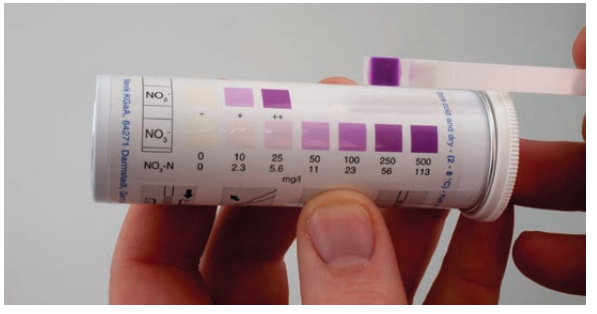
Figure 4. Quick N strips

If the test strip colour falls in between a colour range, you will need to estimate the concentration based on closest colour range. For example, if the reading is between 25 and 50 mg/L NO_3 - but closet to 50 mg/L, a value of 40 would be appropriate.