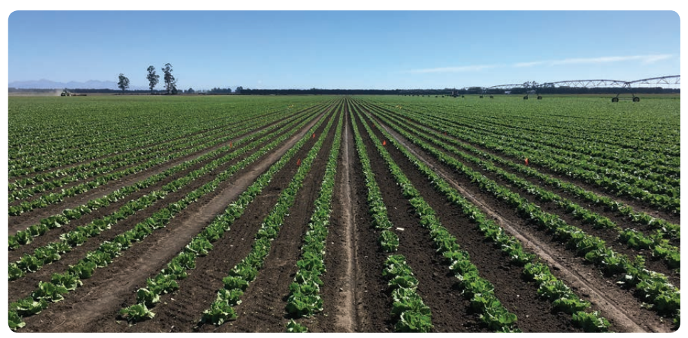
Figure 1. Lettuce.

This Guide provides guidance to growers on how to measure the soil nitrogen supply with Nitrate Quick Test strips and make an informed fertiliser decision for the crop.