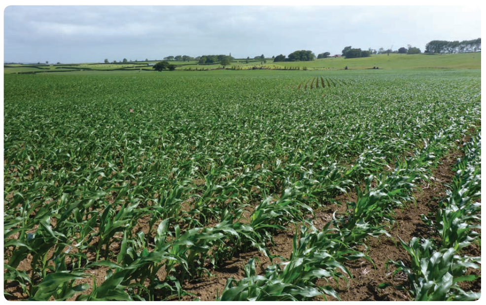
Figure 2. Maize.

For arable crops: www.far.org.nz For vegetable crops: www.fertiliser.org.nz/includes/download.ashx?ID=154153